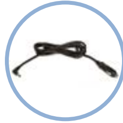
Inogen One ® G4 DC Power Cable* Item # BA-306