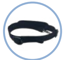
Inogen One ® G4 Carry Strap* Item # CA-401