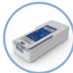
Inogen One ® G4 Extended Life Lithium Ion Battery** Up to 6 hours run time Item #BA-408