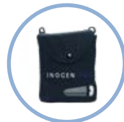
Inogen One ® G4 Carry Bag** Item # CA-400