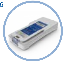
Inogen One ® G4 Lithium Ion Battery* Up to 3 hours run time Item #BA-400